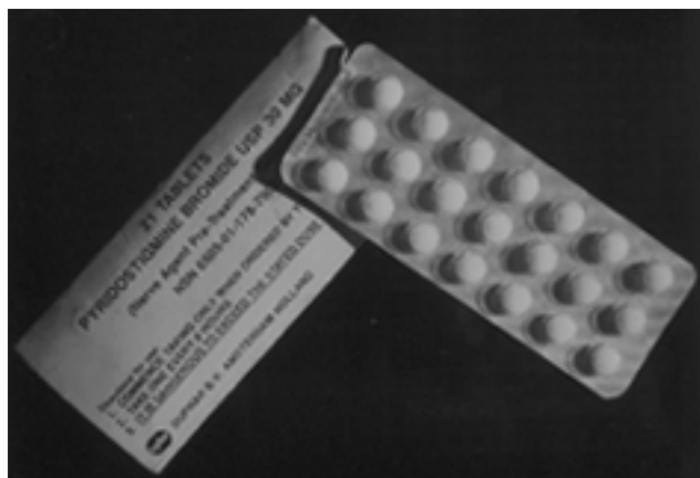
Fig. 6-1. A pyridostigmine blister pack containing 21 30-mg tablets, along with the carrying sleeve. This is the nerve agent pyridostigmine pretreatment set (NAPPS) that was used by designated military personnel during the Persian Gulf War.

stocks of U.S. combat units. The compound is packaged in a 21-tablet blister pack called the nerve agent pyridostigmine pretreatment set (NAPPS, Figure 6-1). One NAPPS packet provides a week of pyridostigmine pretreatment for one soldier. 3